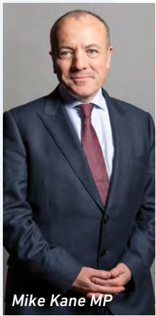
Mike Kane MP

The UK Chamber of Shipping and seven other maritime trade bodies have written to maritime minister Mike Kane to call for a successor to the Clean Maritime Plan to be an early and top priority.